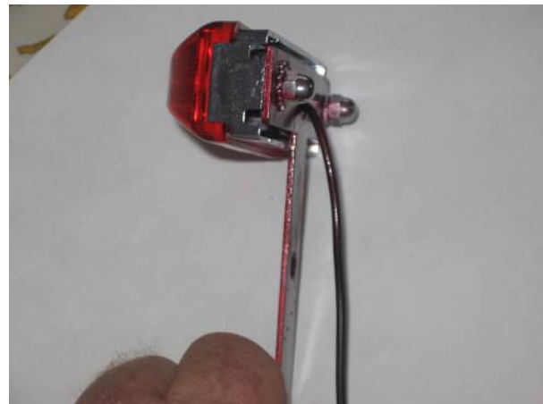
The "T" bracket attached to the light