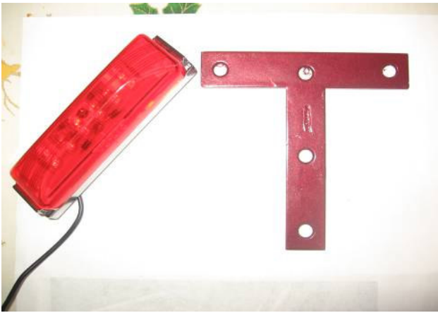
(The l.e.d. light with "T" bracket)